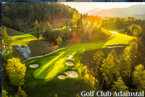
Golf Club Adamstal